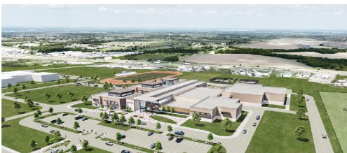
MIDDLE SCHOOL #4

IN DESIGN New Amanda Rochell Elementary School Middle School #4 JW Williams & Cain MS Additions & Renovations