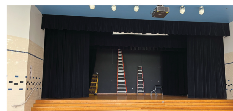
MIDDLE SCHOOL STAGE CURTAINS

Visit rockwallisd.com/2021bondprojects for more information.