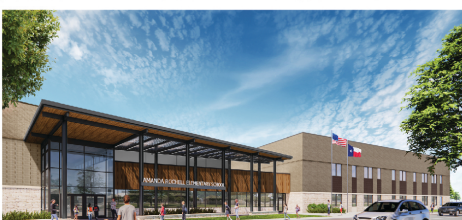
NEW ROCHELL ELEMENTARY SCHOOL

Aquatics Center Interior Renovations Wilkerson-Sanders Turf Replacement Ag Facility Fire Alarm Replacement CLP Furnishing Replacement BP21-A Interior Painting – Amy Parks, CLP, Aquatics BP21-C Site Paving Projects – Amy Parks, CLP BP21-D Fine Arts Projects – Middle School Stage Curtains BP21-E Fine Arts Projects – RHS & RHHS PACs State Curtains RHS & RHHS Piano Lab Equipment Replacements Year 1 School Bus Replacement Cycle Year 1 Technology Rollouts & District-wide Fiber Network Ring