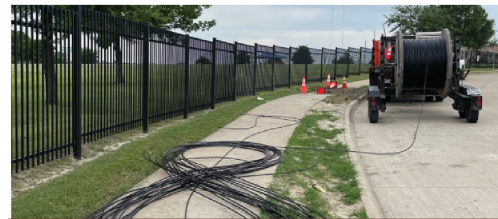
DISTRICT-WIDE FIBER NETWORK RING

UNDER CONSTRUCTION 9th Grade Center(s) – North & South Sites RHS & RHHS Batting Cage Netting RHHS Multi-Purpose Tennis Facility RHHS Multi-Purpose Practice Field