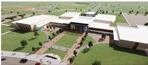
RHS & RHHS 9TH GRADE CENTERS

Estimated total $370,745,000 million in projects in various stages of design, construction or completion